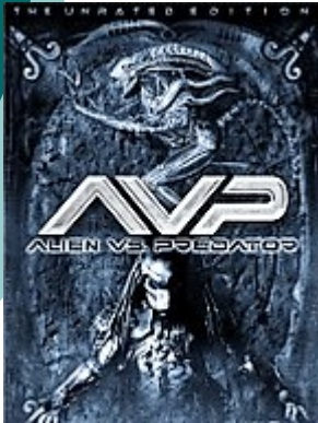
Alien vs. Predator