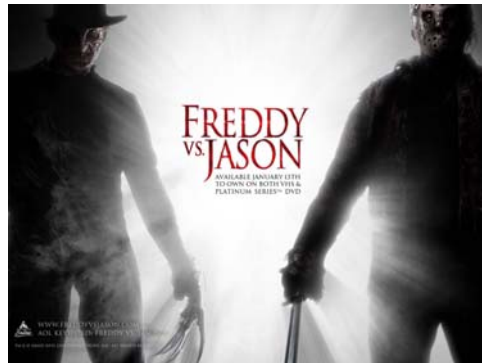
Freddy vs. Jason